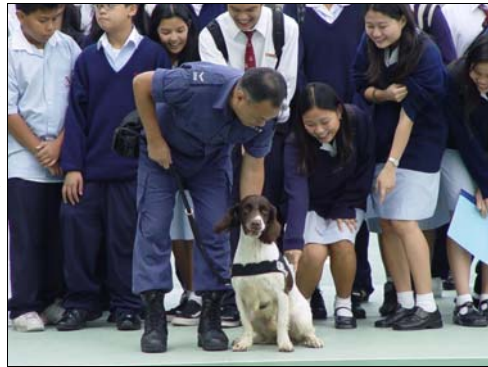
Excited and curious, some students could not help patting one of the cute detection dogs from the Hong Kong Police Force.