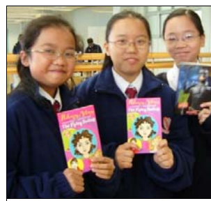
Book Exhibition on 6/12/2005 and 7/12/2005