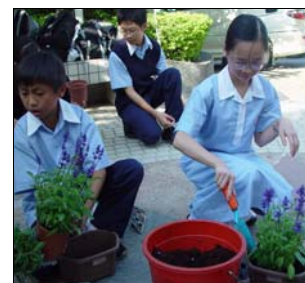
A gardening class was held on 27/10/05 as an after school activity for S1