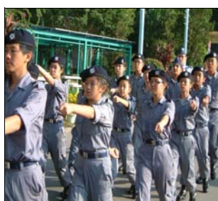
No. 6 Parade of the Hong Kong Air Cadet Corps was conducted on 4/12/05.