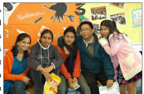
Students enjoyed a day without School uniform on 21 st December

their uniform properly to pass the 70% benchmark. All classes except one fulfilled the requirement and were invited to dress casually on 21 st December. All students participating in this event donated at least $10; teachers were also welcome to join in the donation drive. At the end, a total sum of $7,210.4 was collected. It had been duly donated to Operation Santa Claus.