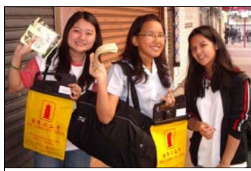
The Community Chest Flag-day Appeal on 26/11/2005